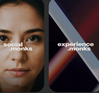
Incredible, immersive digital experiences that bring people together.